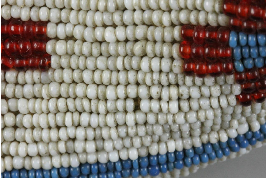
Fig. 5 – Missing Bead – Lower right side back