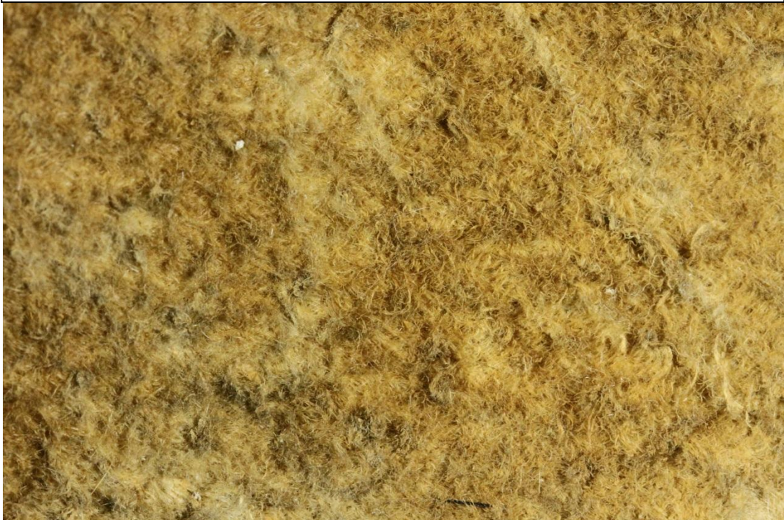
Fig. 8 – Material Loss – Top inside of bottom