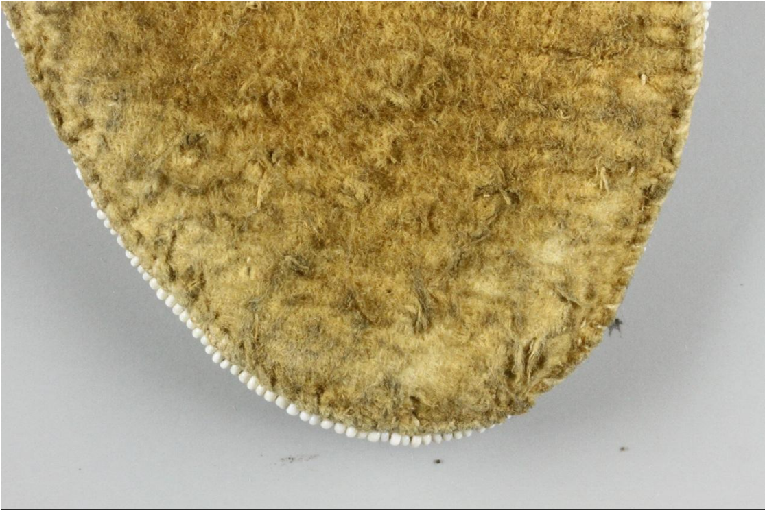
Fig. 9 – Holes – Bottom front center