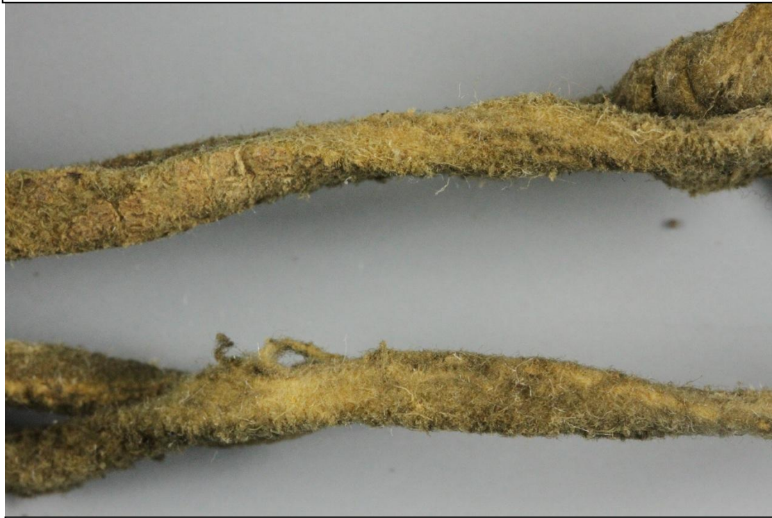
Fig. 2 – Dirt – String section after first knot