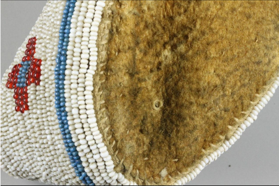
Fig. 8 – Hole – Bottom back center