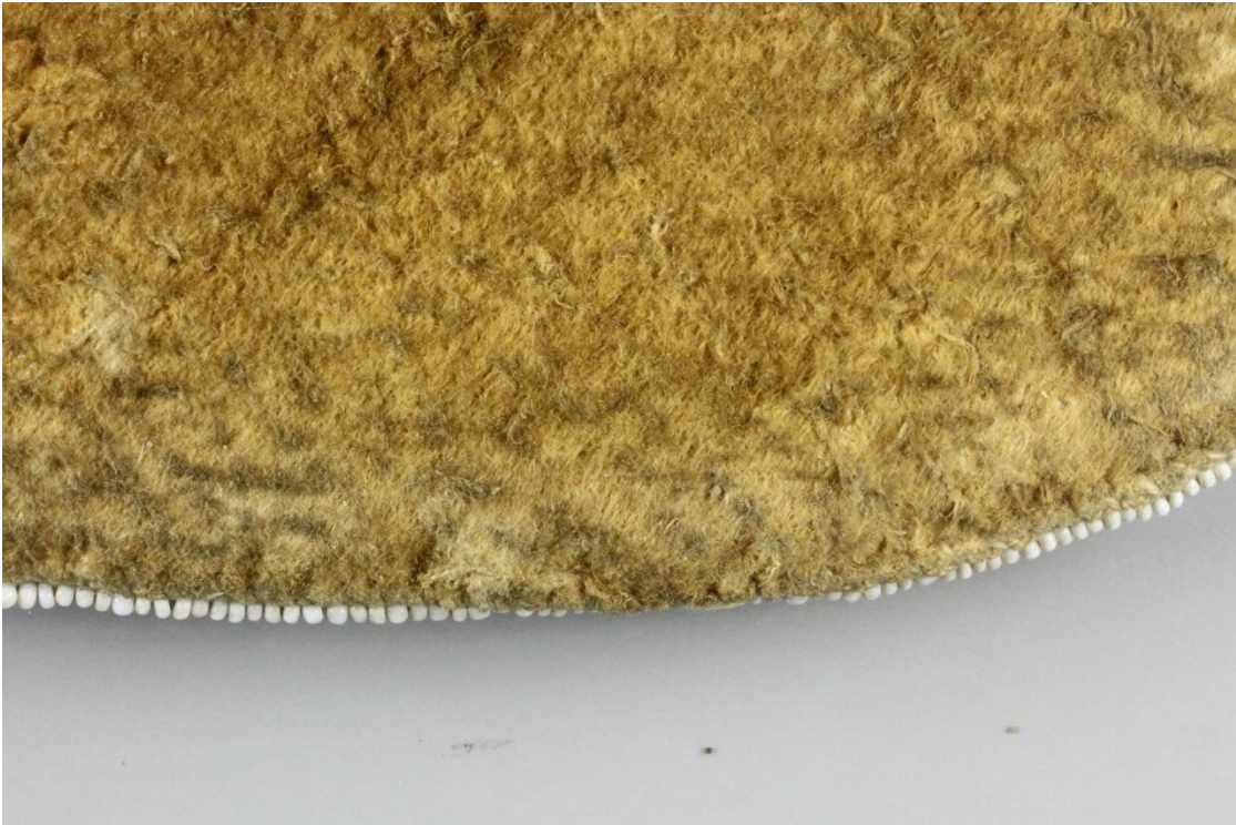
Fig. 7 – Dirt – Bottom left side