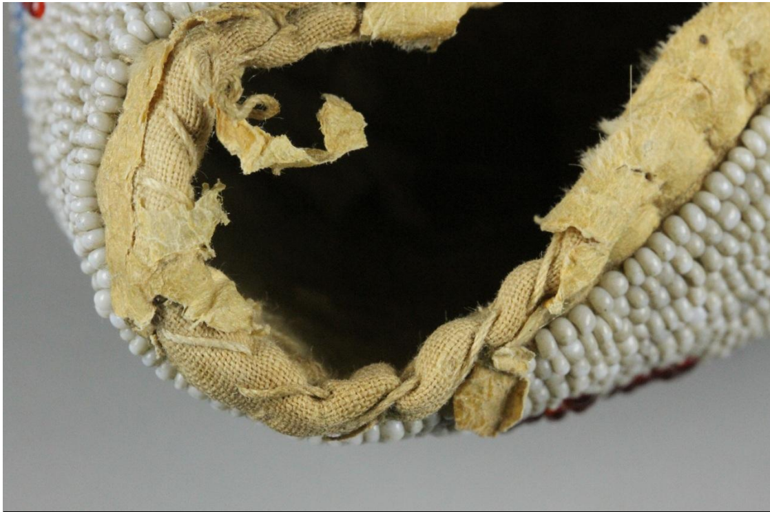
Fig. 3 – Paper – Top edge of opening