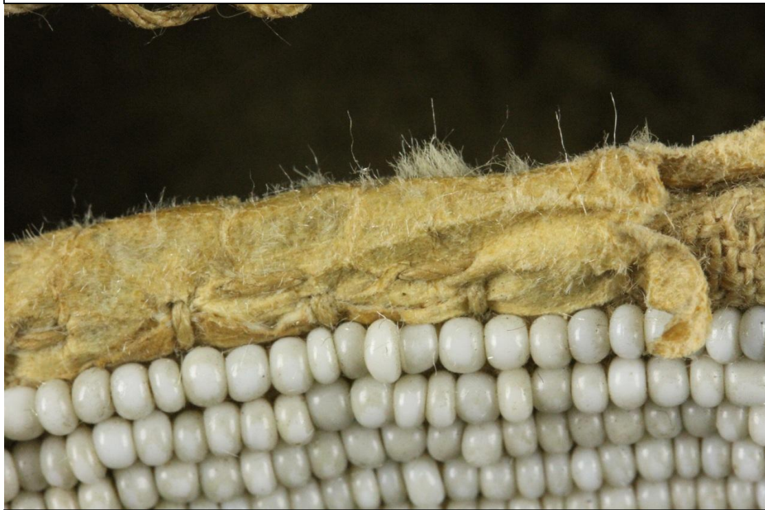
Fig. 4 – Paper – Top edge of opening