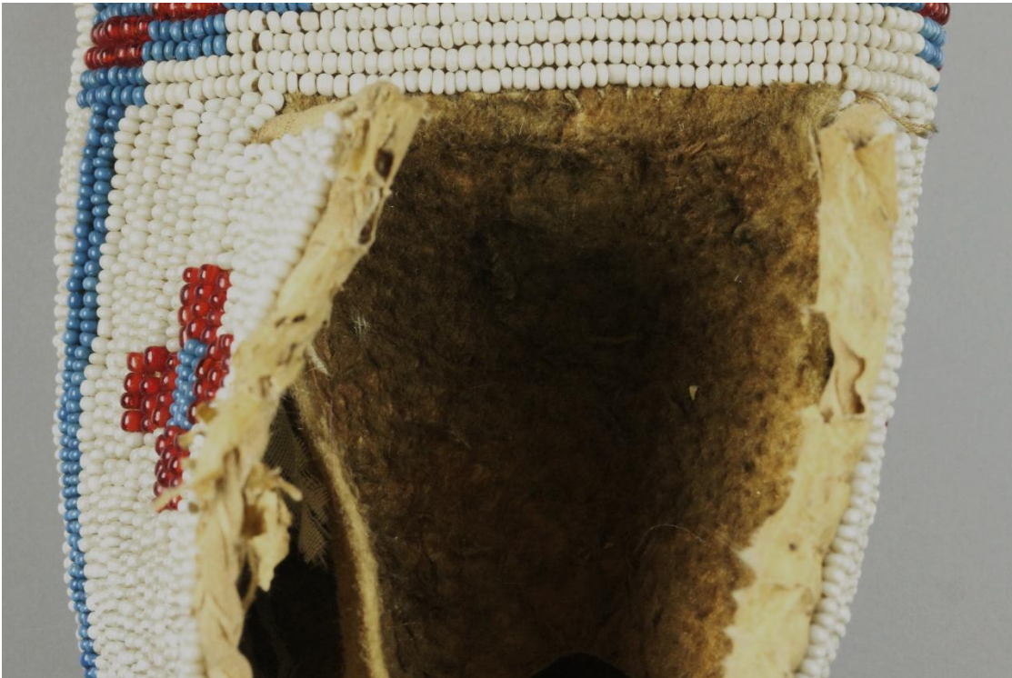
Fig. 1 – Flap – Top center