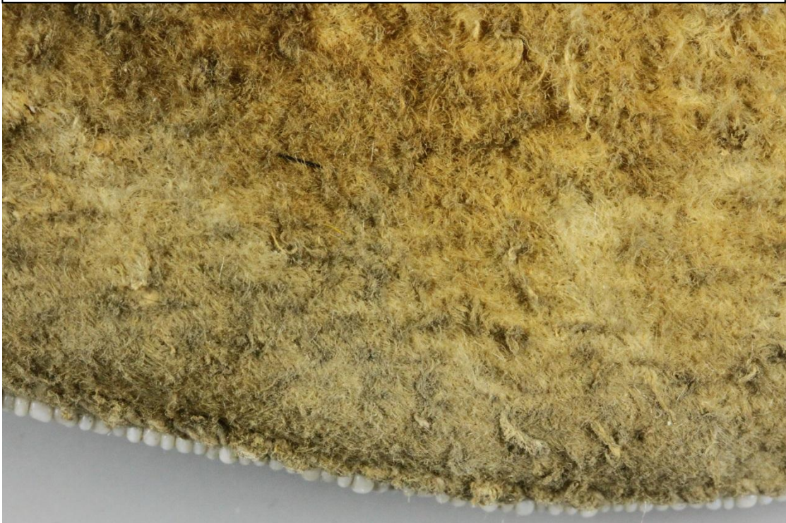
Fig. 6 – Dirt – Bottom front right side edge