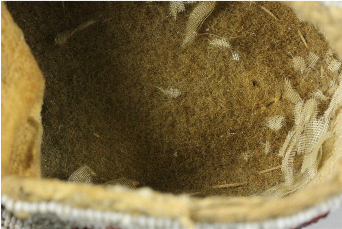
Fig. 1 – Material Loss – Top inside of bottom