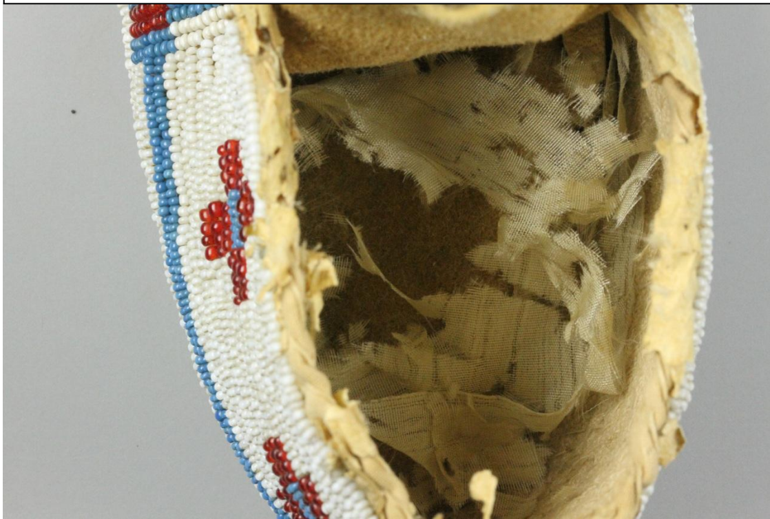
Fig. 4 – Material Loss – Top inside of bottom