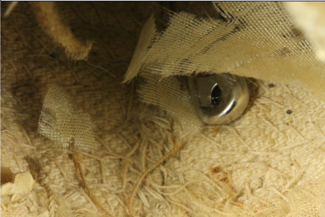
Fig. 10 – Safety Pin – Top inside of back