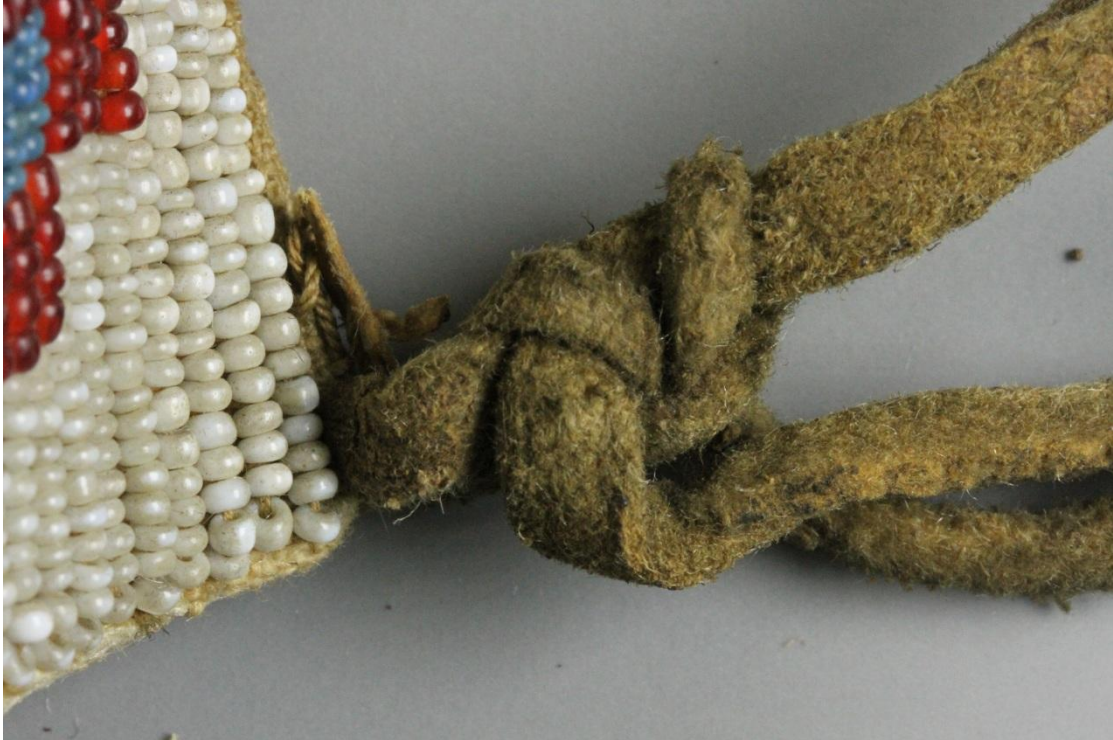
Fig. 3 – Knot – Top right side back edge of opening