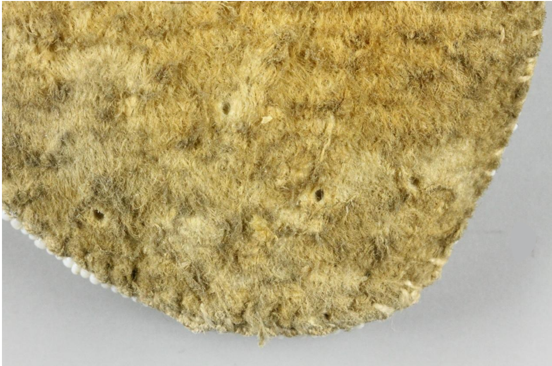
Fig. 9 – Holes – Bottom front center