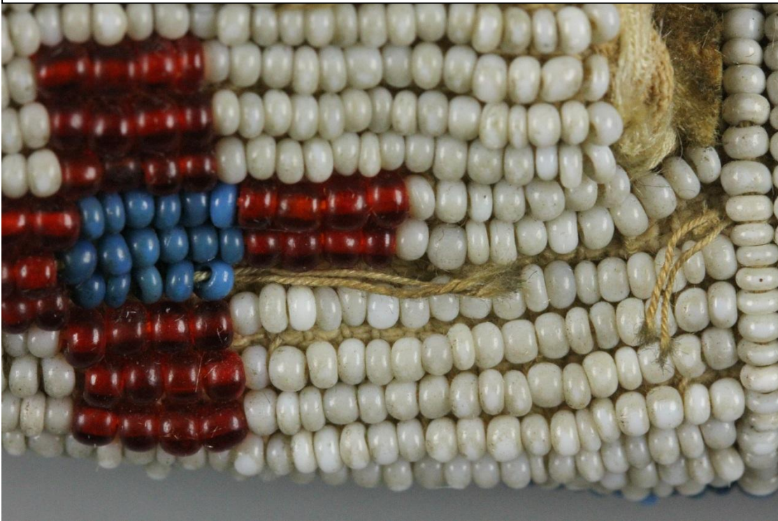
Fig. 2 – Missing Beads – Lower right side center