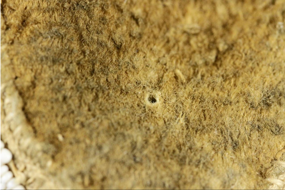
Fig. 7 – Hole – Bottom back center