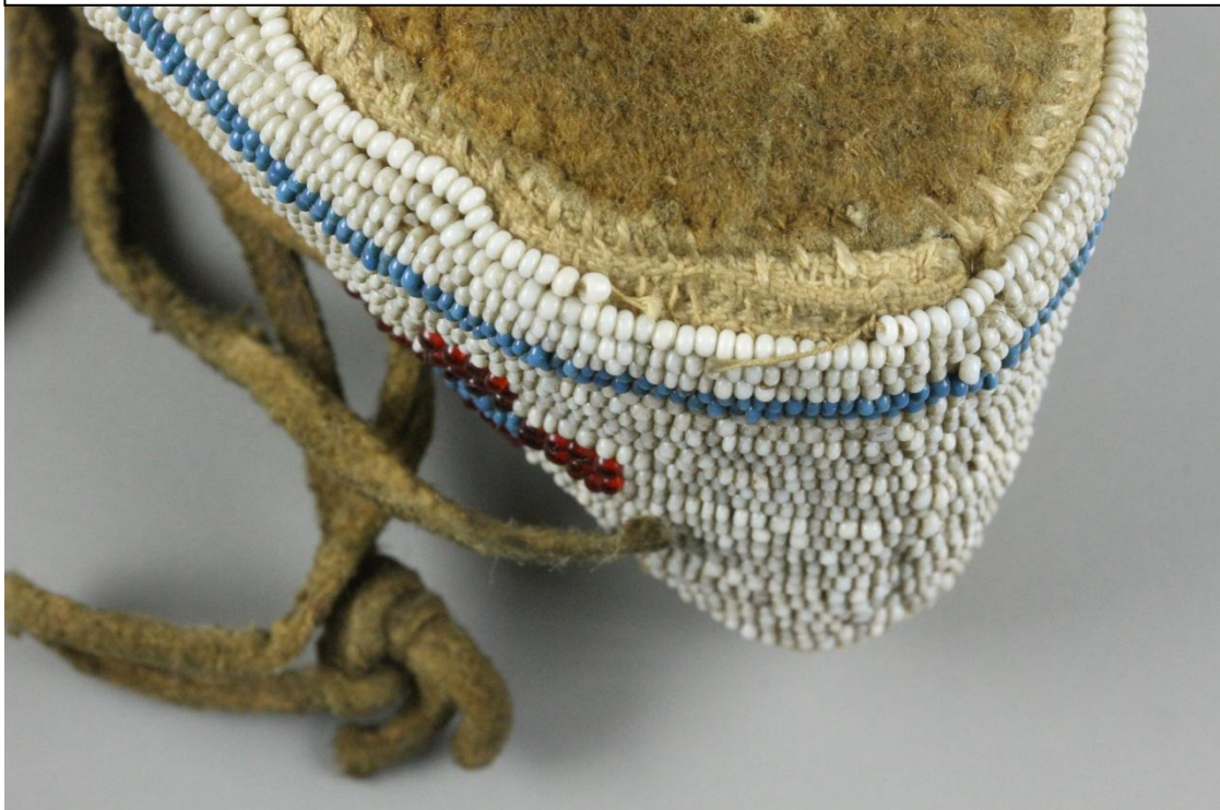
Fig. 10 – Missing Beads – Bottom back left edge