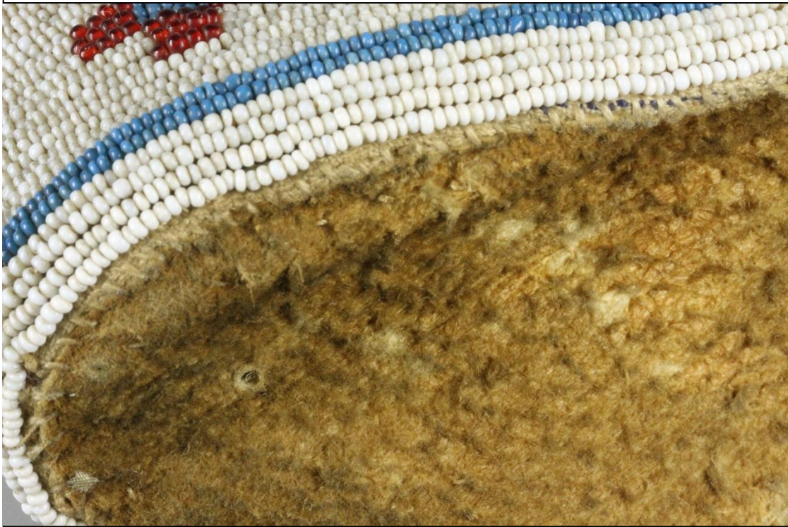
Fig. 6 – Wear – Bottom right side edge