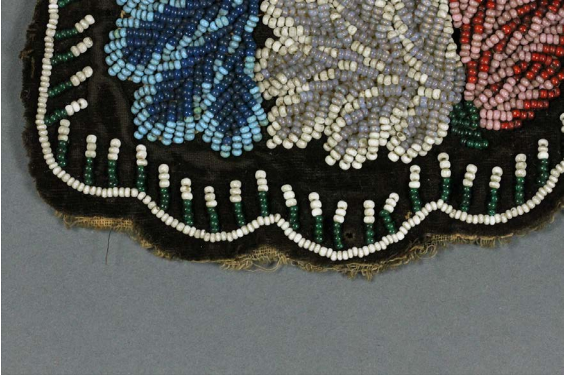
Fig.9 – Missing beads and hole – Back bottom edge of flap