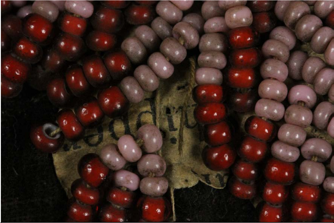
Fig.2 – Paper – Front top right