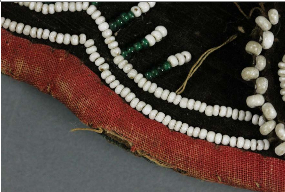
Fig.8 – Missing beads – Back center right side