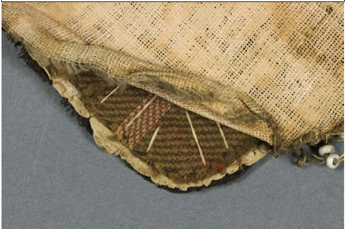
Fig.6 – Seam release – Front inside right bottom of flap