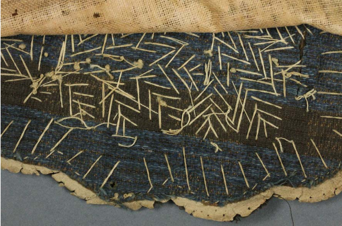
Fig.13 – Seam release – Back inside flap