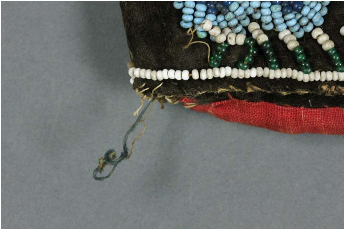
Fig.1 – Loose threads – Front top left corner edge