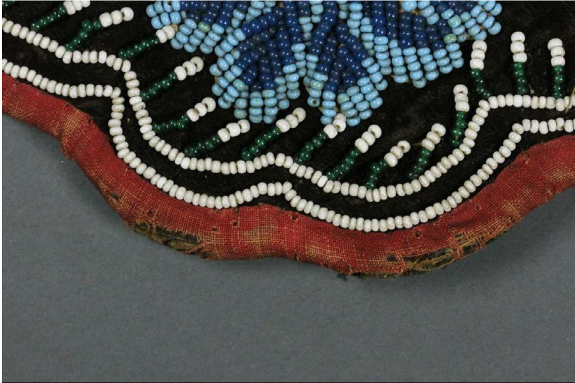
Fig.11 – Material loss – Back edges