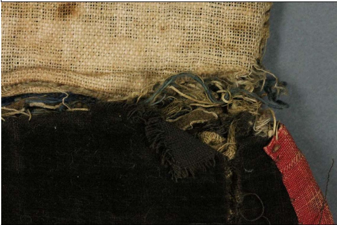
Fig.12 – Tear – Back inside right flap hinge