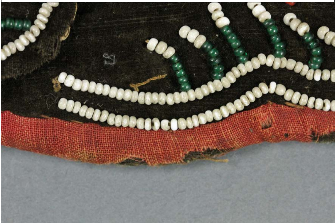
Fig.4 – Missing beads and material loss – Front center left edge