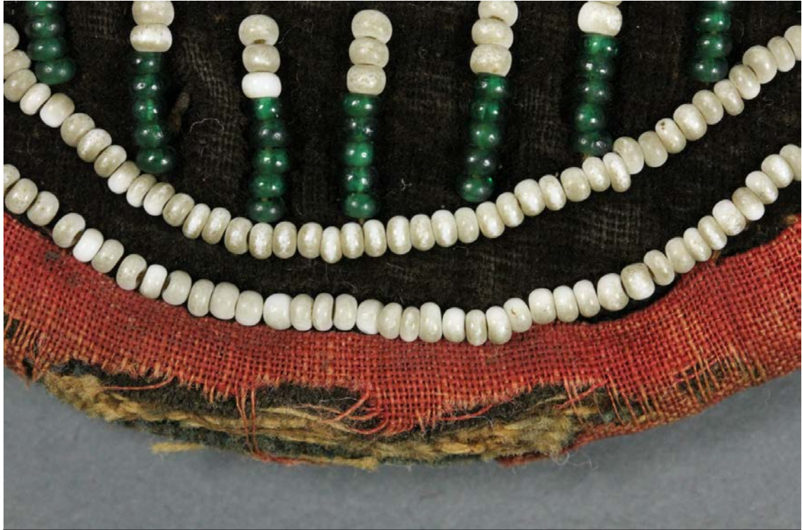
Fig.5 – Material loss – Front bottom center edge