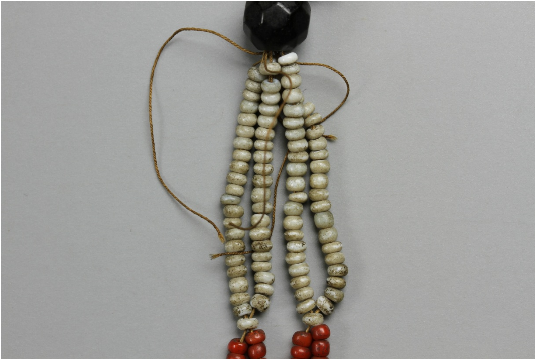
Fig. 1 – Abrasions – Tassel