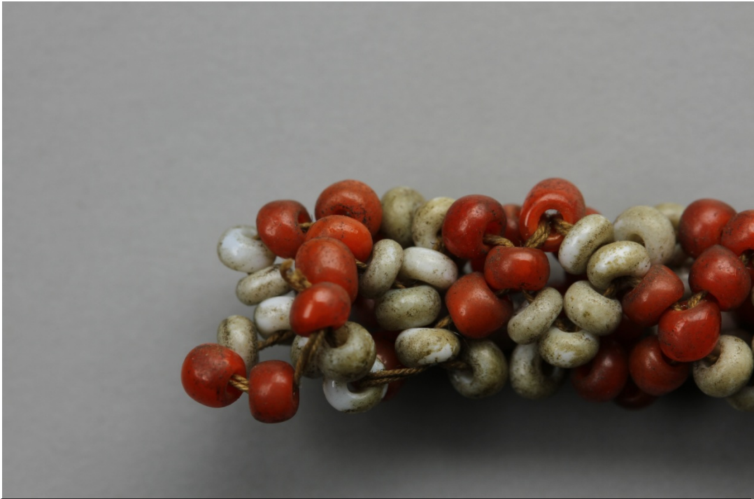
Fig. 5 – Broken end – Front top left center