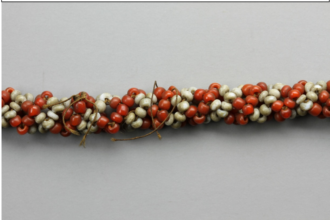
Fig. 4 – Loose Threads – Front top right center