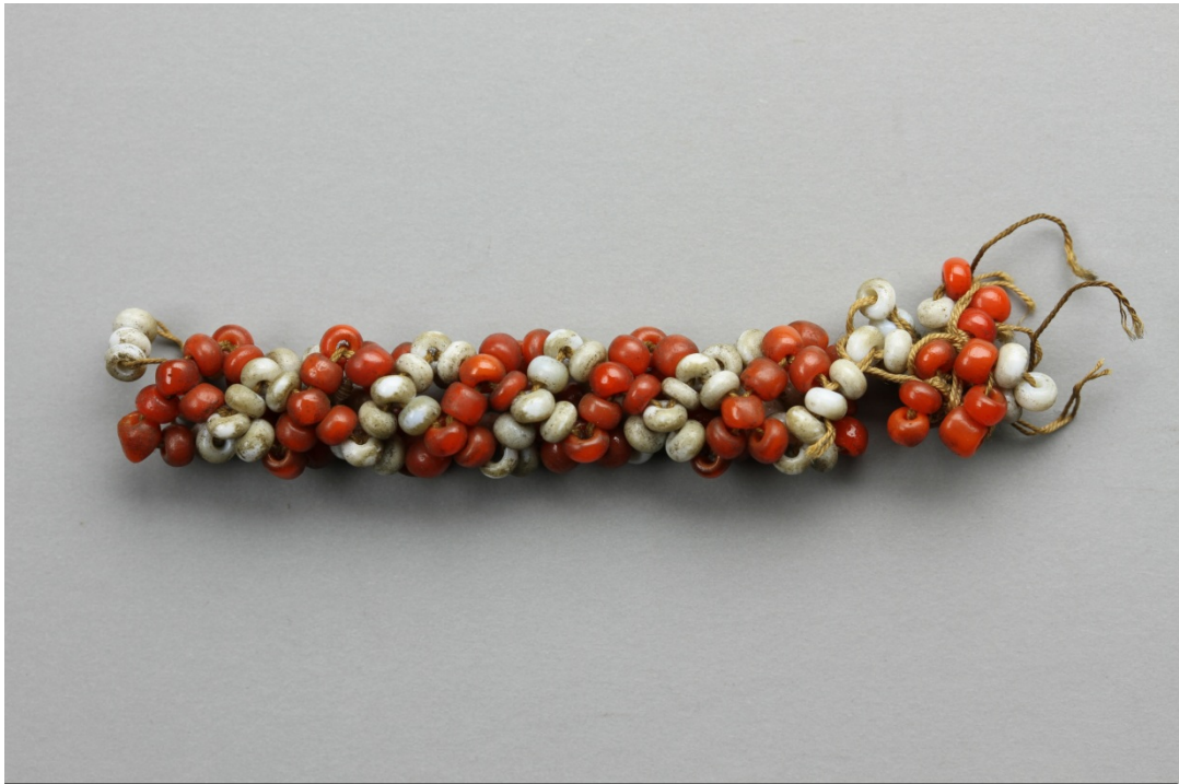
Fig. 3 – Remnant – (B)