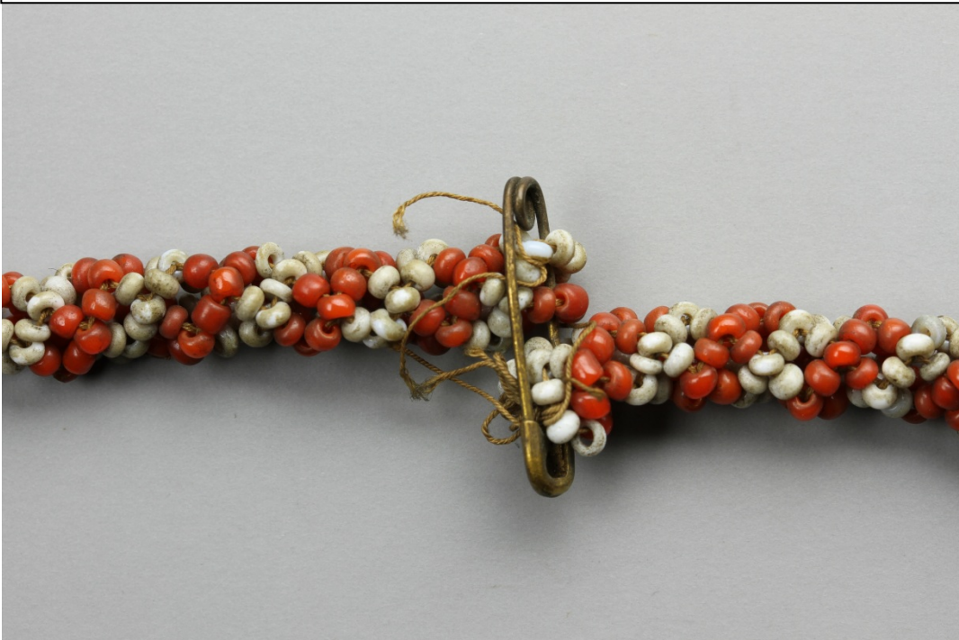
Fig. 2 – Pin