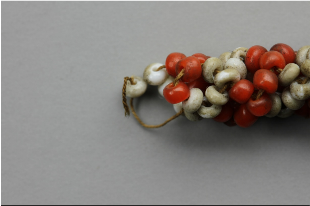
Fig. 6 – Broken End – Front top left