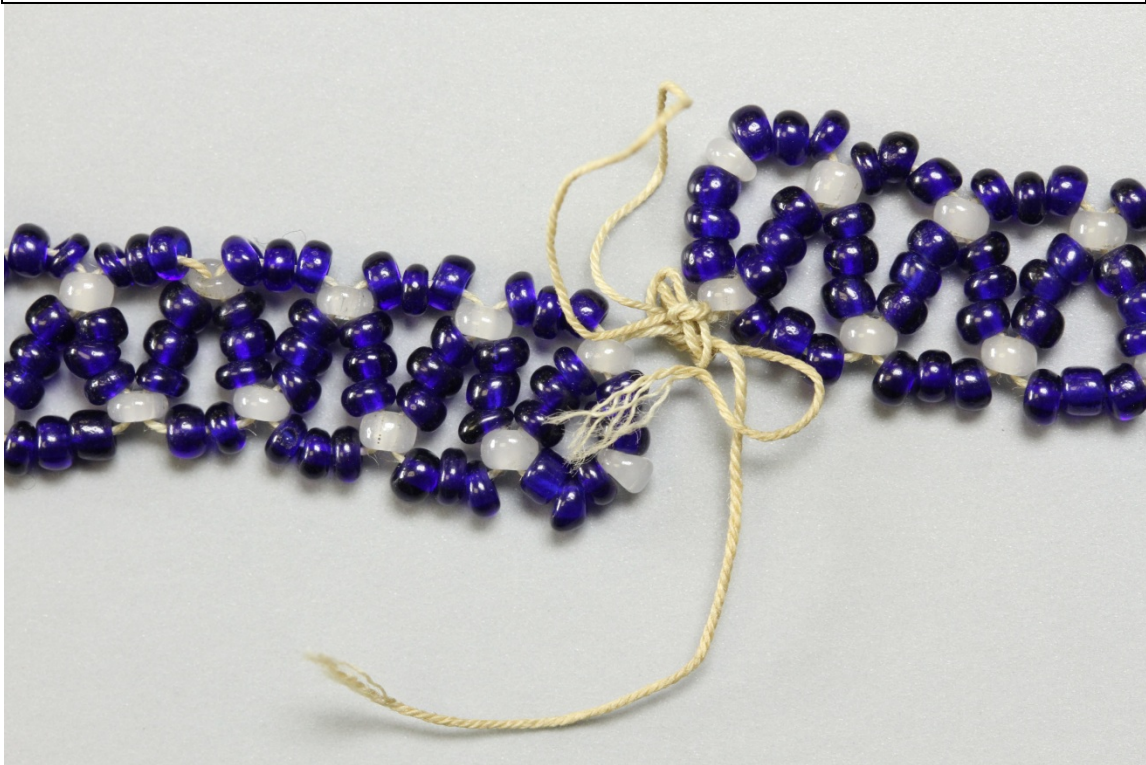
Fig. 2 – Repair – Front top right center