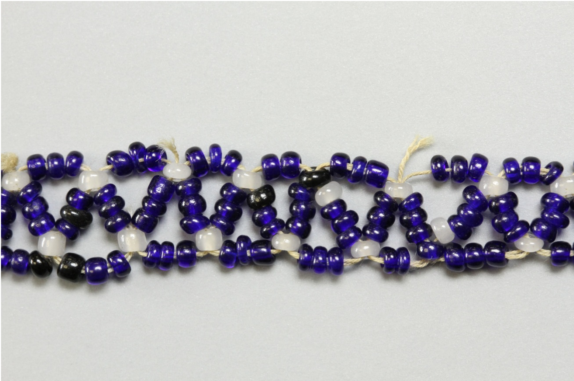
Fig. 1 – Loose Threads – Front top left center