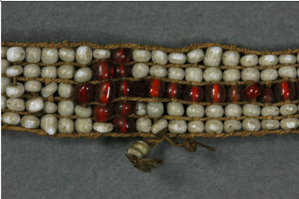
Fig. 4 – Loose threads – Front top left side