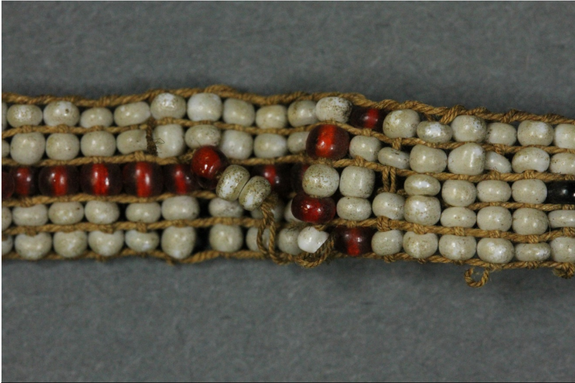
Fig. 3 – Stress – Front lower center