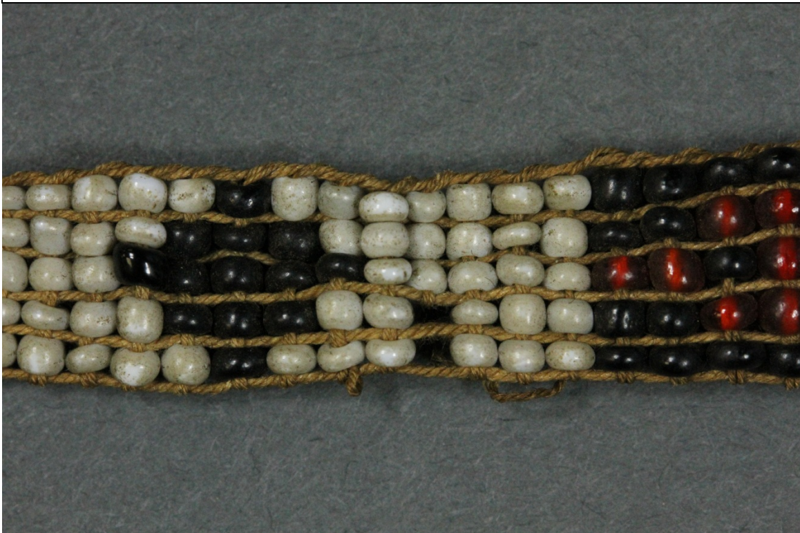
Fig. 2 – Missing Beads – Front top right side