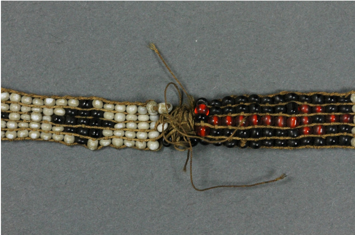
Fig. 1 – Knot – Top