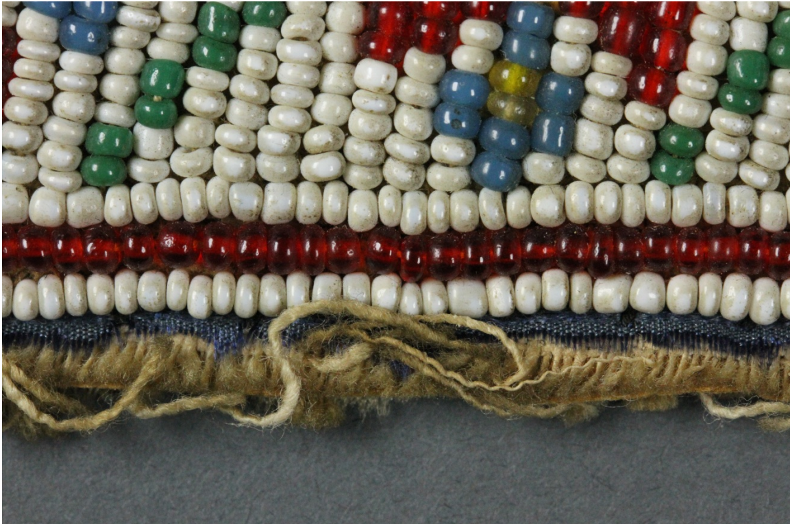
Fig. 1 – Fraying – Front left center edge