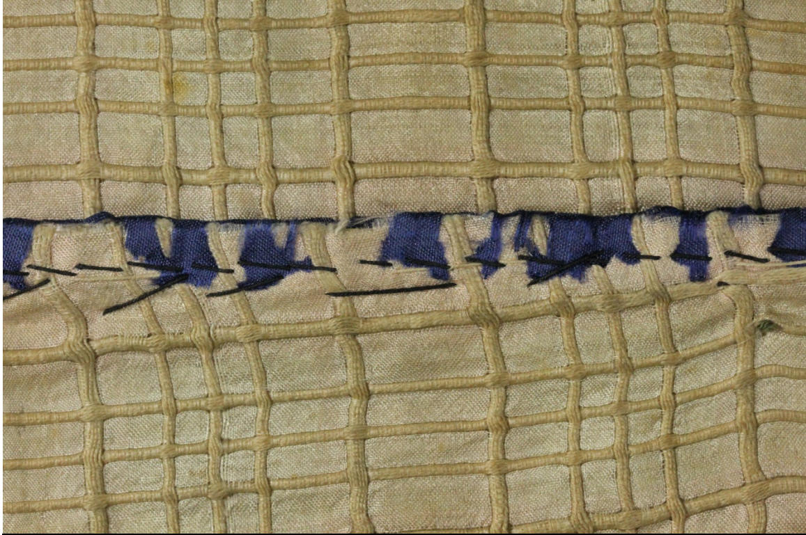
Fig. 3 – Remnants – Back center