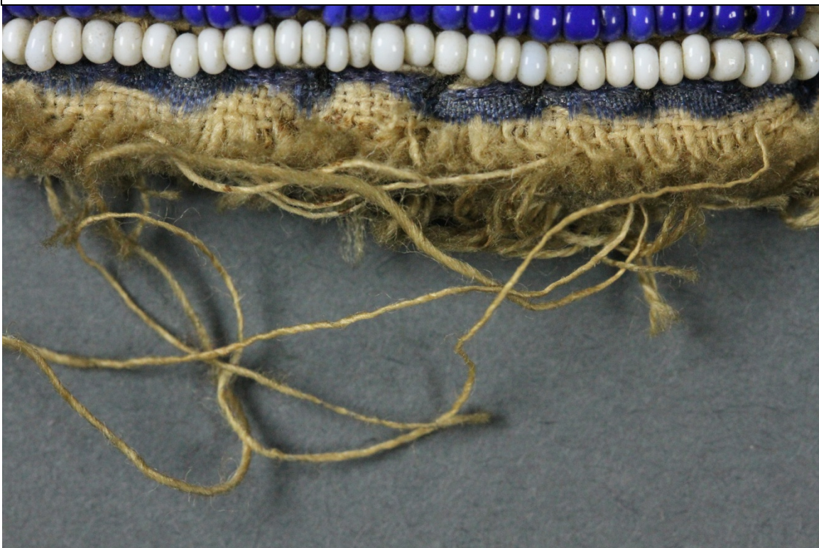
Fig. 2 – Loose Threads – Front top right edge