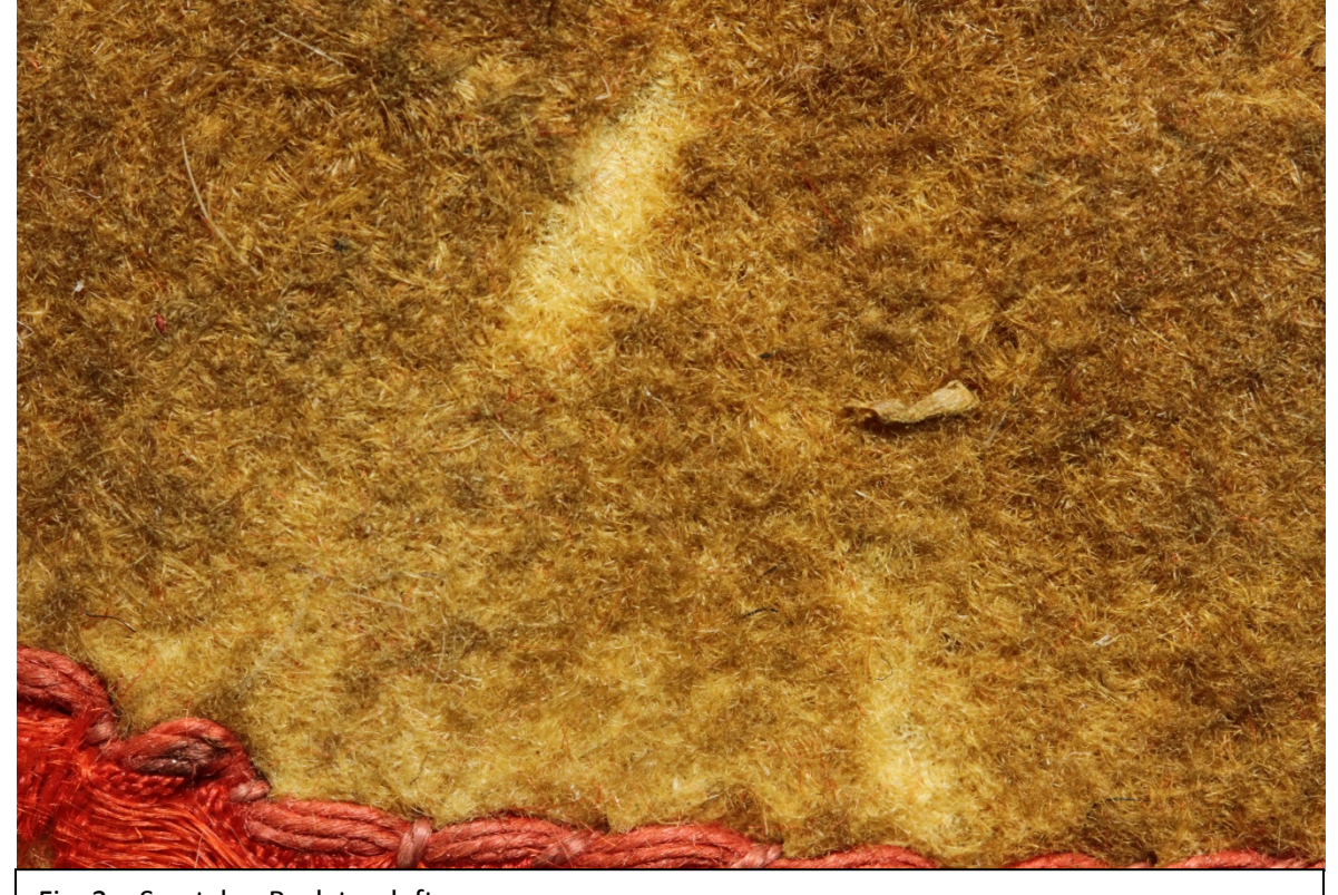
Fig. 2 – Scratch – Back top left