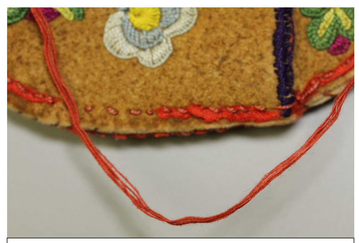
Fig. 1 – Loose Thread and Wear – Center right side