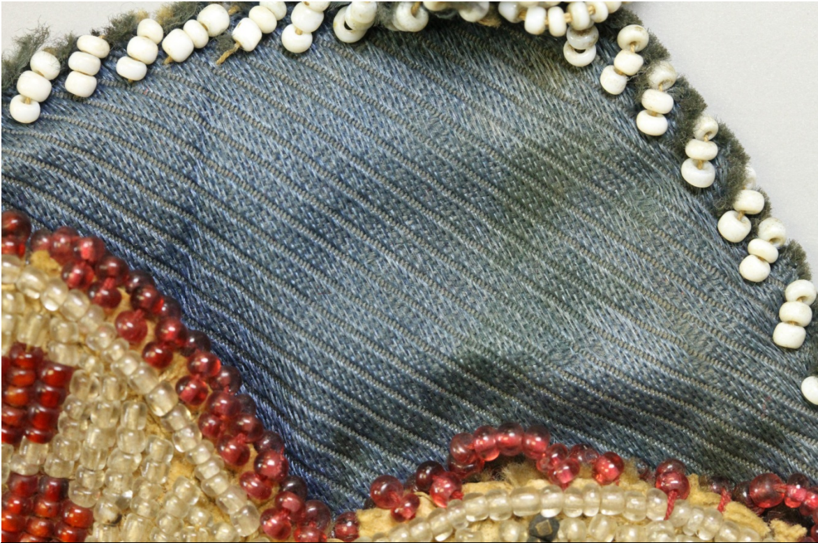
Fig. 1 – Stain – Front op inside right edge