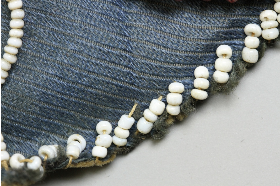
Fig. 5 – Fraying – Front top left edge