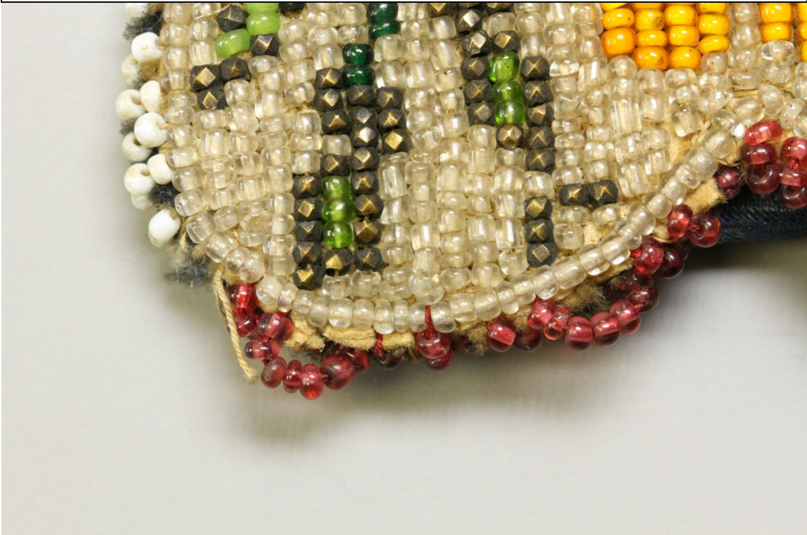
Fig. 2 – Loose Beads – Front top right edge