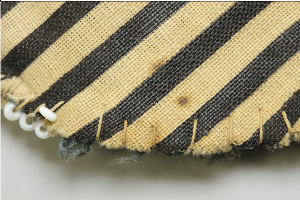
Fig. 4 – Stain – Back bottom right edge