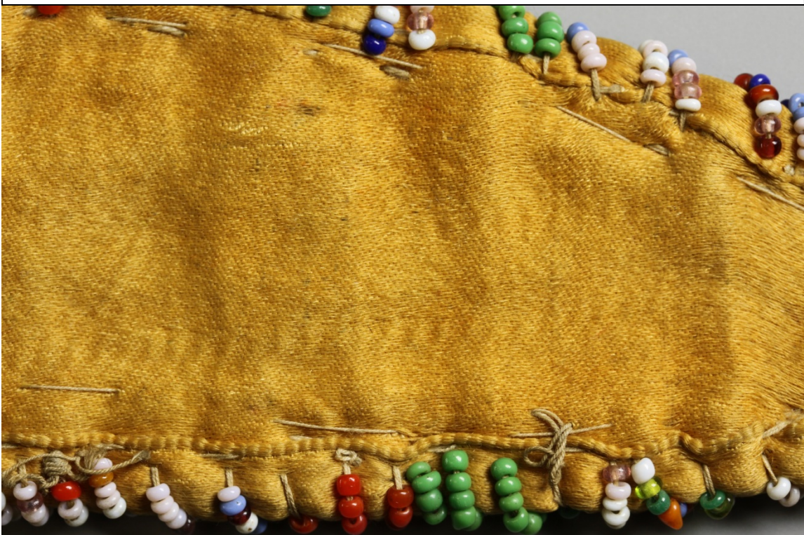
Fig. 2 – Tension – Back top edge