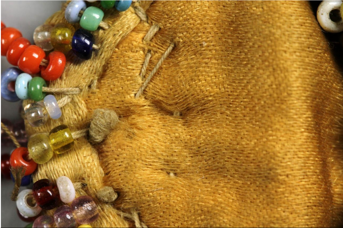
Fig. 1 – Wear – Front top inside