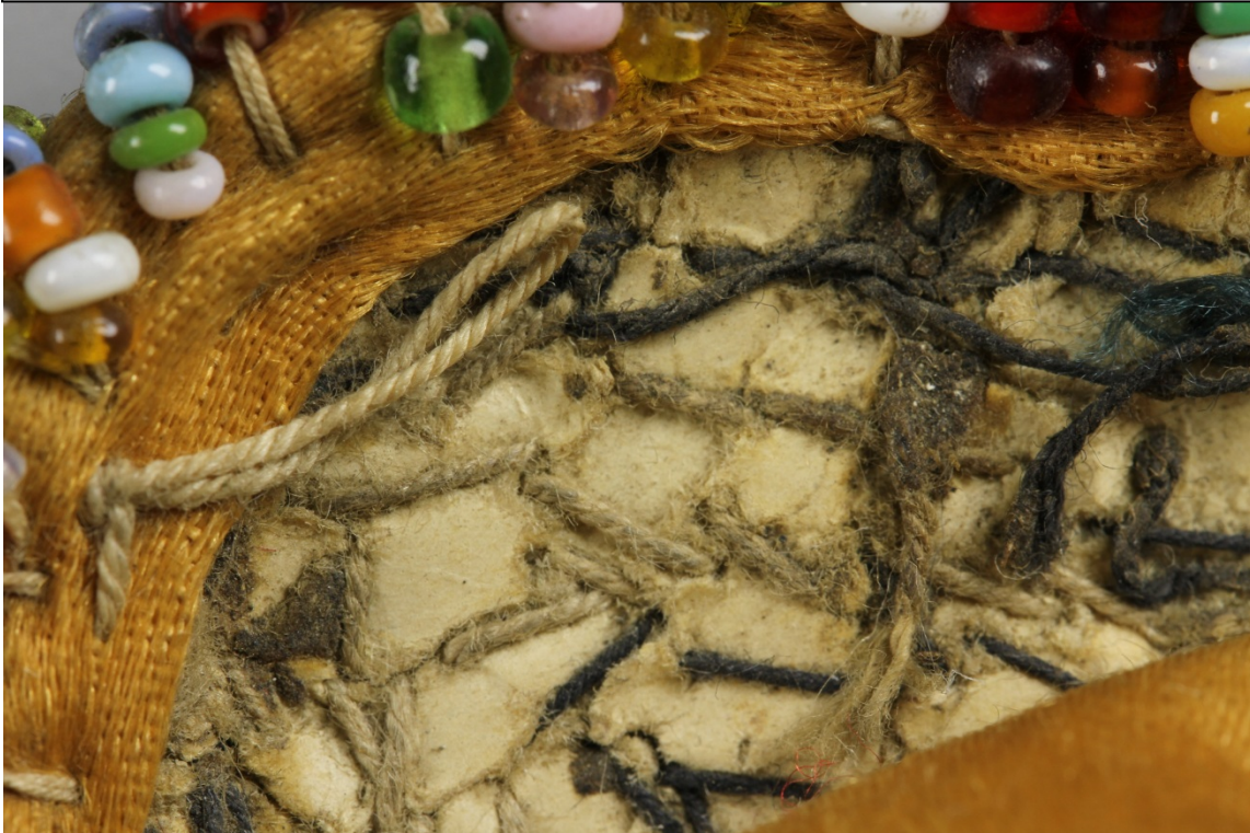
Fig. 4 – Tear - Inside