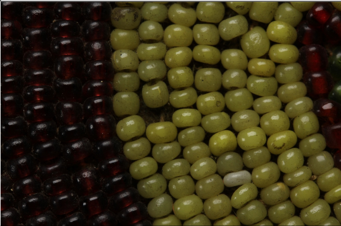
Fig. 6 –Missing Bead – Front top right center