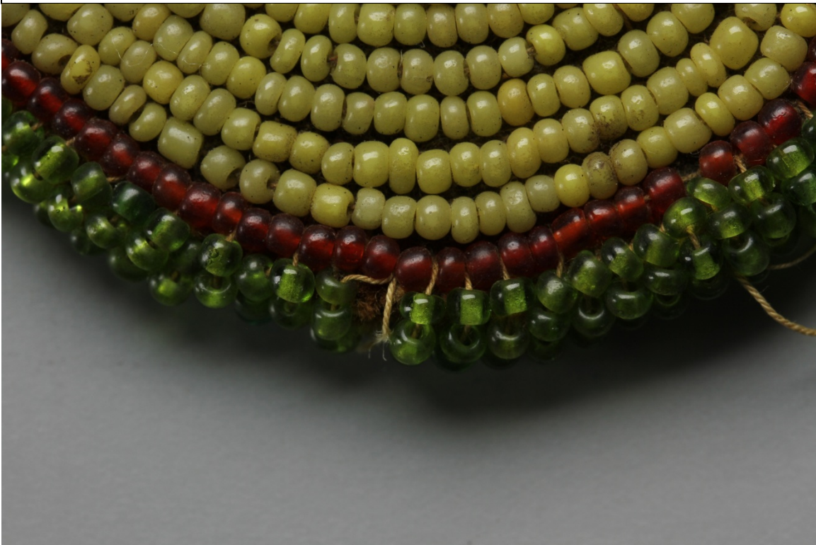
Fig. 4 – Missing Beads and Loose Thread – Front top right edge