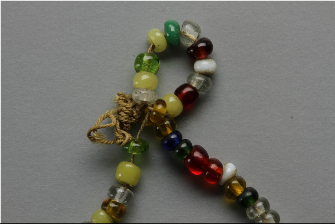
Fig. 3 –Knot and Loop – String