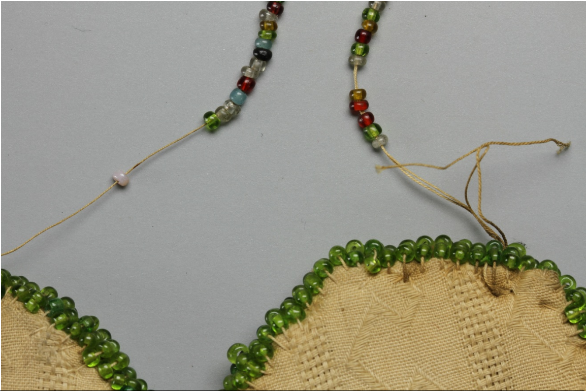
Fig. 1 –Missing Beads and loose Threads – Back top right edge