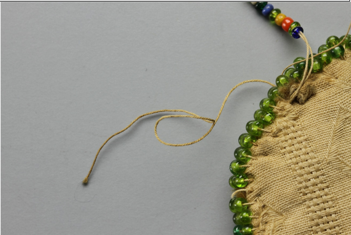
Fig. 2 – Loose Threads – Back top left edge