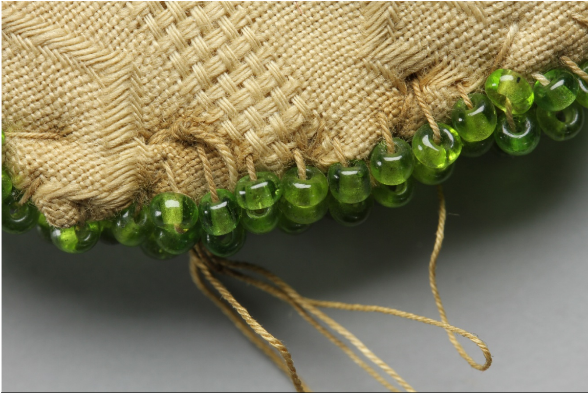
Fig. 7 –Stain – Back top right edge