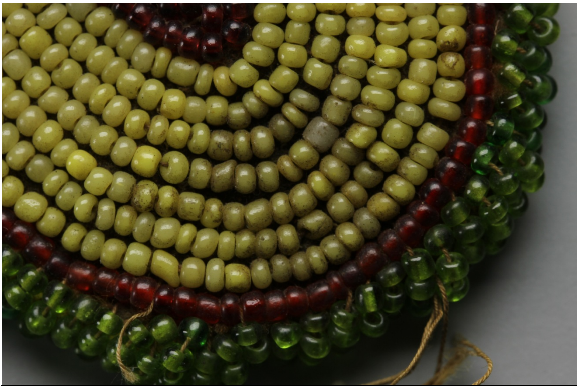
Fig. 5 –Dirt – Front top left edge