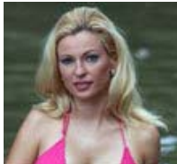
Today's Gallery Calendar 2009 Swimsuit 2008

Between 1998 and 2000, she was spokesman for the Coalition for an Inquiry into the Death of Dudley George.