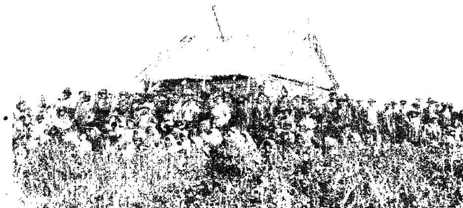
"THE HISTORICAL HALL" TROUT LAKE

tions of the Crown. The ground was thoroughly covered, the commissioners entering into explanations with a particularity of detail, realizing that in the past certain claims have been made that the Indians did not fully understand the meaning of their act.