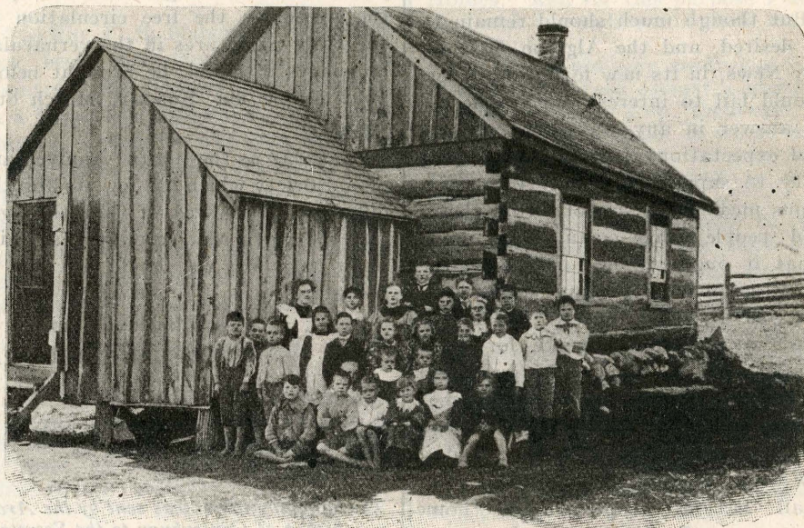
A COUNTRY SCHOOLHOUSE

The two last (for 1872 and 1873) are of particular value to Algoma. Perhaps some friend who has them will send them to the Bishop of Algoma.