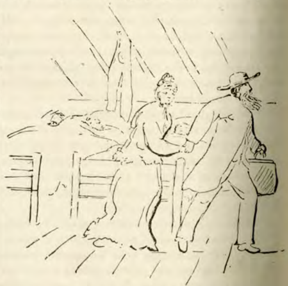
THROUGH THE MEN'S ROOM.

"Now, my dear," I said, "your time has come." So my wife resignedly followed me. I had already tracked the way pretty well by this time, and I led my beloved wife by the way where the water and slush was the least deep and where the mud was the thinnest; I showed her how to bend herself down and to crawl under the cattle truck; I led her over the slippery board which crossed the ditch, and round the great puddle in front of the shanty. Then I opened the door and introduced her inside the shanty. My wife was a little surprised. But I did not allow her to remain in the lower apartment. "Follow me up-stairs, beloved," I said to her in a hoarse whisper; and my wife followed me up the stairs. The stairs led to a loft; the wind was whistling and howling through the shingles; in the loft were six beds, and men's garments hanging on nails from the rafters. My wife felt slightly agitated. I led my wife