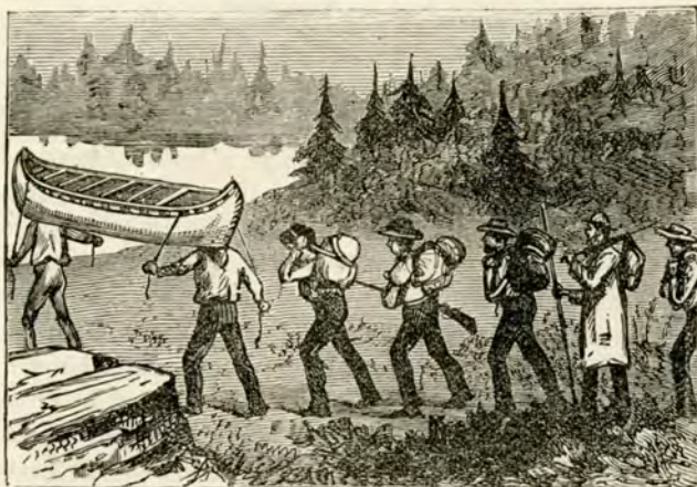
PORTAGING UP THE NEEPIGON.