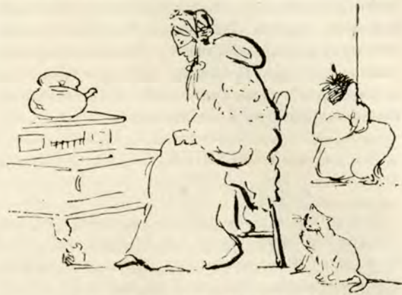
DOUBTFUL ABOUT GOING TO BED.

After supper was cleared away in the evening, my