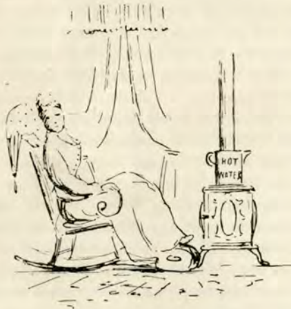
HAPPY AT LAST.

THE arrival at Darlington was a pleasant surprise. My wife had rather dreaded lest the hotel might prove to be one of the same character as that at Oklahoma; but it was not so. Not one of the four mules enjoyed the removal of its collar from its heated neck, and the burying of its nose deep in its feed of oats, more thoroughly and gratefully than did my wife her arrival that night, in a charming little white-curtained bed-room, in the Darlington hotel, with a bright little fire in the stove, and warm water to wash in. And then, down-