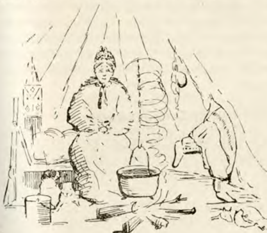
IN AN INDIAN TEEPEE.

structure painted white. It was ten minutes to four when we entered the large class-room in which all the children were assembled, and school would be dismissed at four, so we waited. The dismissal was worth seeing. The teacher played a lively tune on the piano which stood on the platform, an Indian boy whom she called up stood beside her striking a triangle, and, to the sound of the music, the children all marched out with a quick, lively step—not by the shortest way to the door, but by the longest way possible, strading backwards and forwards through the long lines of desks, in serpentine fashion, and producing quite a kaleidoscopic effect. After they were all gone we went over the building and saw their comfortable dormitories with iron bedsteads and spring mattresses, and blue check coverlets, also the dining hall, kitchens, etc.