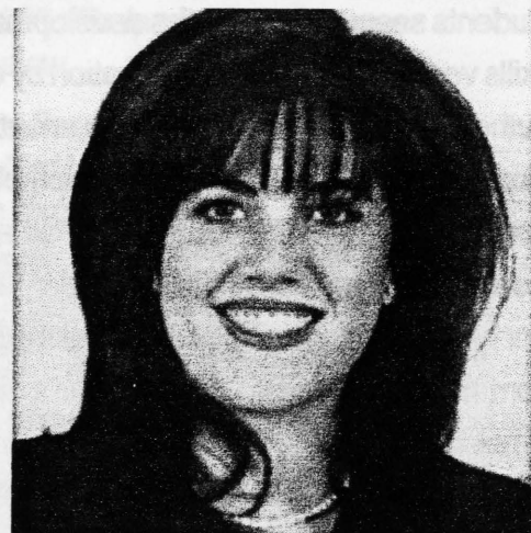
Monica: "Do I have something in my teeth?"

10) President Clinton - There was something in the news about an intern, but I forgot what it was.