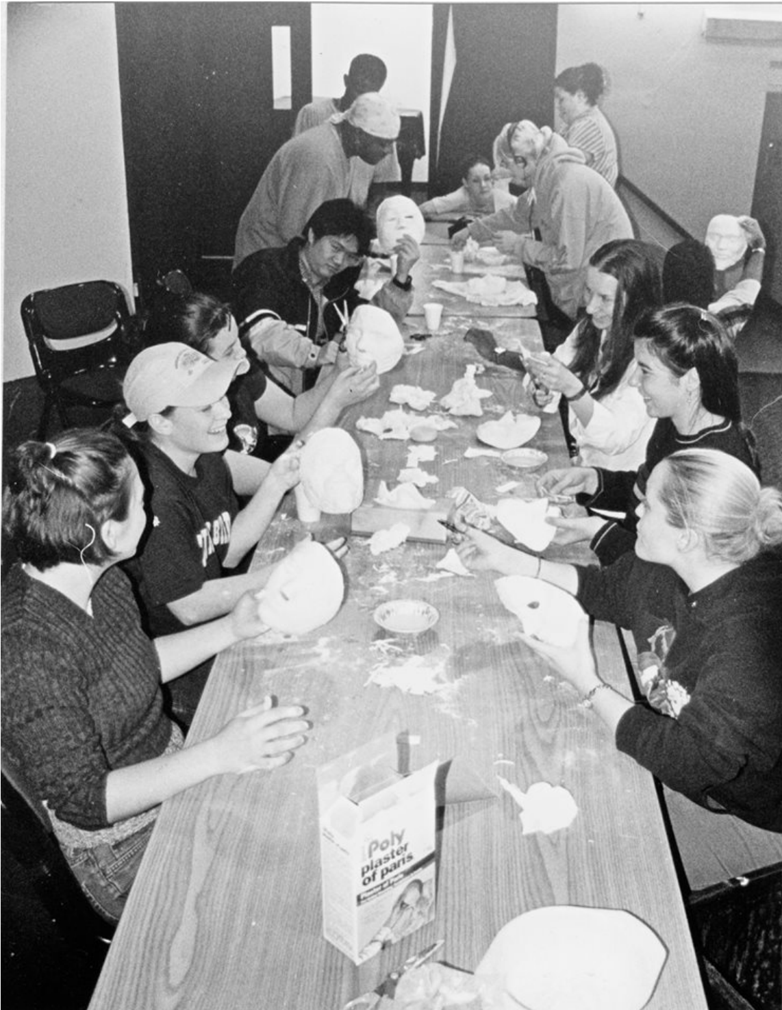
Intro Theatre 2001.